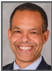
Senator Malcolm Augustine